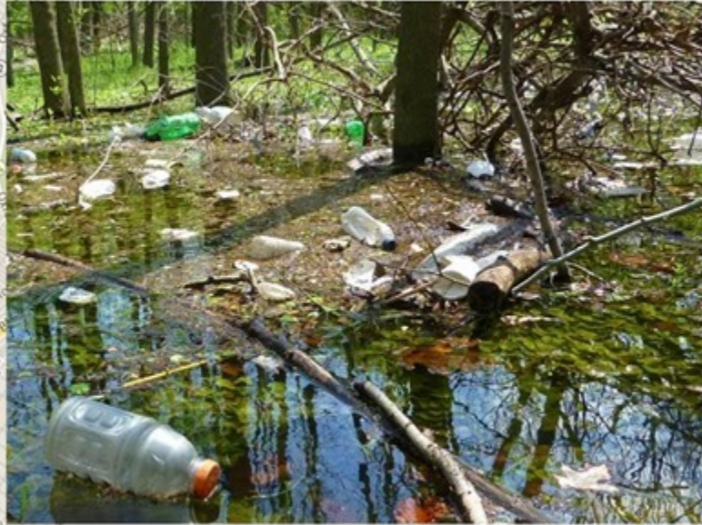
Tacony Creek Floodplain Just Upstream Roosevelt Blvd (5/3/14)

Where do they go? Tacony – Frankford Creek Floodplain